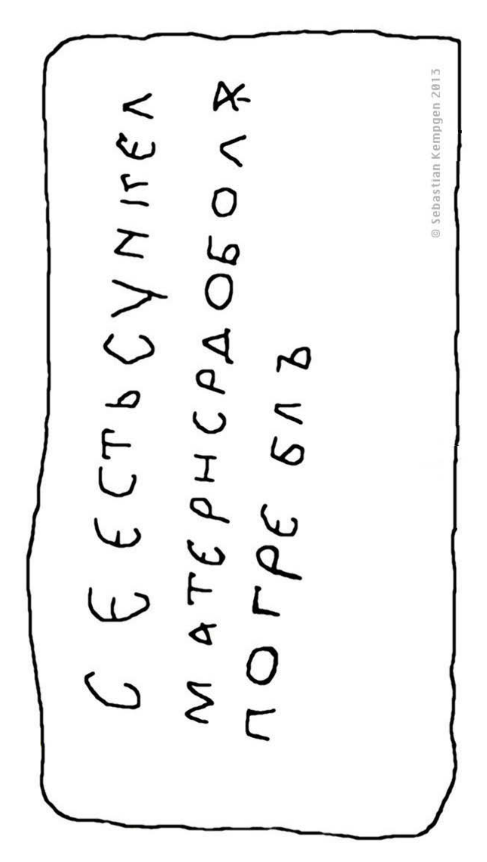
Fig. 3: Drawing of the Synkel inscription (© S.K.)