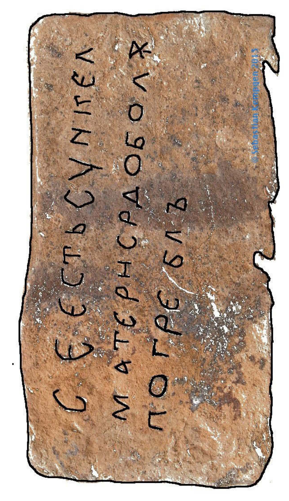
Fig. 2: Photograph with drawn overlay