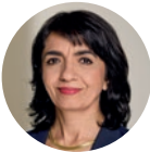
President of the State Parliament Muhterem Aras