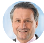
Dr. Hans-Ulrich Rülke FDP/DVP