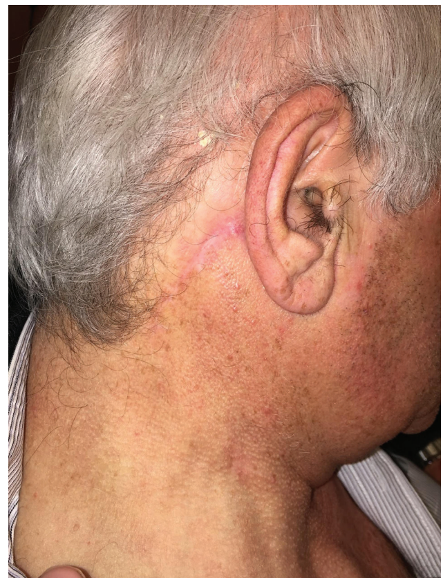
Fig. 3 Aesthetic result after 1 month of follow-up

aesthetic impact if compared with the conventional lateralcervical approach, making scars invisible. In 2013, Tae et al. showed in their study the use of a retroauricular approach with the support of a robotic device compared with conventional neck dissection, showing the overlap of the two techniques in terms of results obtained (on an oncological, functional and aesthetic level). 13 In 2014, Greer Albergotti