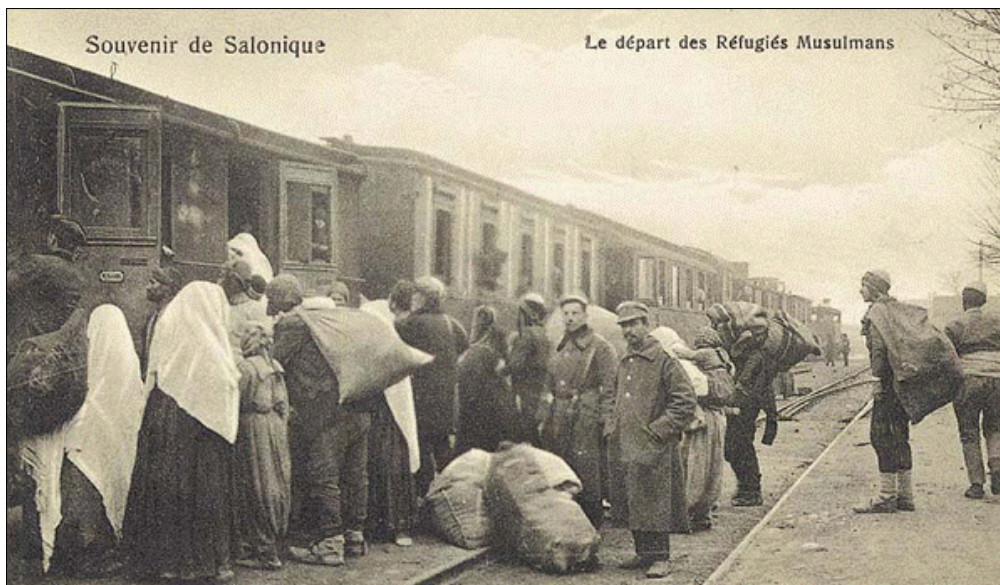
Fig. 4: Muslim-Turks from the Greek Kingdom in 1923.

A note on the Ottoman/Turkish archives is in order. The main problem is the access to some archival holdings; concretely, the Internal Ministry's Immigration Commission Documents (Dahiliye Nezareti Muhacirin Komisyonu Evrakı, DH.MHC) and the Turkish Ministry of Foreign Affairs. The holdings of DH.MHC were recently opened to researchers. The migration policy could thus far only be depicted using documents obtained from the files of other ministries, primarily the Interior Ministry. Although the funds of the Immigration Commission for the republican period have been opened (the Toprak İskan Genel Müdürlüğü Arşivi/General Directorate of Land and Settlement), they have not yet been examined critically in terms of the open-door policy. Moreover, the archives of the Turkish Ministry of Foreign Affairs are not fully opened.