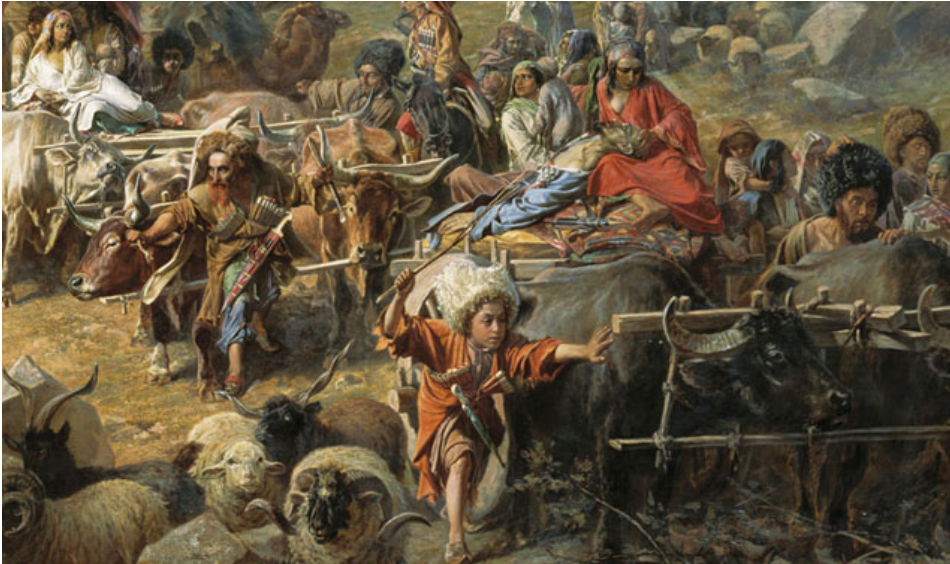
Fig. 1: An iconic paint of the 1864 Caucasian migrants. A section from "The mountaineers leave the aul" of Pyotr Nikolayevich Gruzinsky (1837–1892).

the homogenisation of the country. Most of the literature on Turkish migration (hereafter, literature) mainly argues that the "push factors" dominated, that Ottoman/Turkish immigration policy was shaped mainly by humanitarian concerns, and that the Islamicisation and Turkification policies were their consequences.