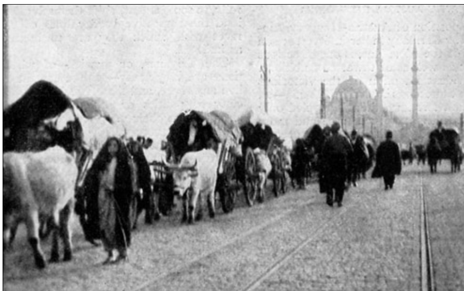
Fig. 3: Iconic photo of 1912 Balkans' migrants. Frederick Moore, National Geographic Society.

cally and importantly, these researchers fail to take into account the pull factors such as aid and exemptions offered in their not-so-open-door policies. 26 Although these were very generous in the late Ottoman Empire, they decreased in the republican period. This aid included free land and housing in addition to exemption from military service and taxation. 27 This project therefore argues that the ODP itself was a pull factor. Indeed some studies approach the Russian open-door policy and the exemptions it promises as pull factors, 28 although almost none of these studies consider the Ottoman/Turkish ODP as such.