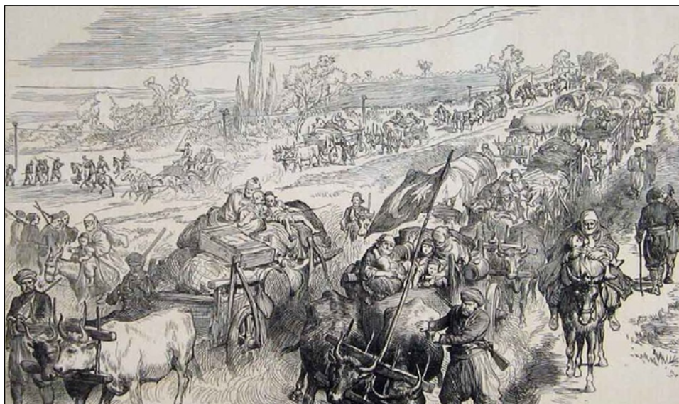
Fig. 2: 1878 Migrants. The Illustrated London News , September 1, 1877, 213.

Epistemological difficulties are due to the limits of terminology, archives, and literature. More specifically, they are tightly tied to the "power" that determines taxonomies and knowledge. The most important term that comes to the fore is muhacir (literally, migrant) which is different from the present-day understanding of the term.