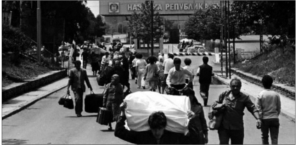
Fig. 5: 1989 Muslim-Turkish Migrants from Bulgaria. Yeni Şafak , November 4, 2019.

migrations from these three regions experienced periods of high intensity, they were spread over a long period. Migrations from Crimea began when the Ottoman Empire ceded Crimea with the 1774 Küçük Kaynarca Treaty. The biggest migration took place during the Crimean War and until 1863. According to Kırımlı, migration lasted until 1944, especially during the years of 1810, 1812, 1816, 1819, 1827, 1856, 1860–62, and 1864–65. 42 The longest-lasting source of migration was the Caucasus, a region Islamised but never fully controlled by the Ottomans. After the suppression of the Sheikh Shamil Rebellion against Russian expansion, the great migration took place in 1864. The second wave took place during the 1877–78 war and continued at a lower intensity until the collapse of the empire. 43 There were also other migrations that were different from preceding ones and had their own ethnic and regional characteristics: Nogay (1859–62), 44 Batumi (Muslim Georgian, 1878, 1914), 45 "Oriental refugees" (1916). 46 The third region of migration was the Bal-