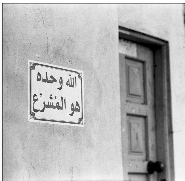
Figure 6: »God alone is the Lawmaker.« Poster on the wall of a mosque in Alexandria, October 2011.

The published version fits strikingly well into a theory of the secular that has been developed by Khaled Furani (2012) and Michael Allan (2016) in regard to contemporary Arabic literature. The secular, they argue, is not just about people being more or less religious, but rather about the creation of autonomous fields and forms of language that relegate religion to the position of a separate field. Their work is inspired by the work of Talal Asad (2003) and others (e.g. Asad et al. 2009, Agrama 2012) who argue that »the secular« is pri-