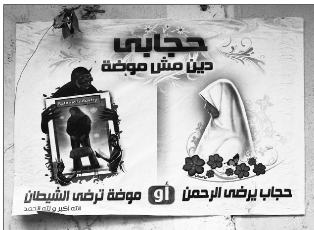
Figure 3: »My hijab is religion, not fashion. Hijab that pleases the Merciful, or fashion that pleases Satan. God is great, Praise to God.« Poster by the Muslim Brotherhood (unsigned but recognisable by design and slogan) in northern Egypt, February 2010.

With this essay, I follow in the footsteps of those contributions, and reflect on the power of the monotheist God as it is recognised and reckoned by Muslim Egyptians I have worked and lived with during the past two decades. This article is not based on dedicated fieldwork about God, but instead on the accumulated knowledge of many years of fieldwork and friendship in various contexts with Egyptians from different walks of life. I have learned much in situations that were not understood to be research encounters by the people involved. Some people I know in Egypt consider their relationship with God to be a highly private and intimate matter, so parts of this article are intentionally vague in their references to specific people and contexts. However, three people make an explicit appearance. Because much of my field-