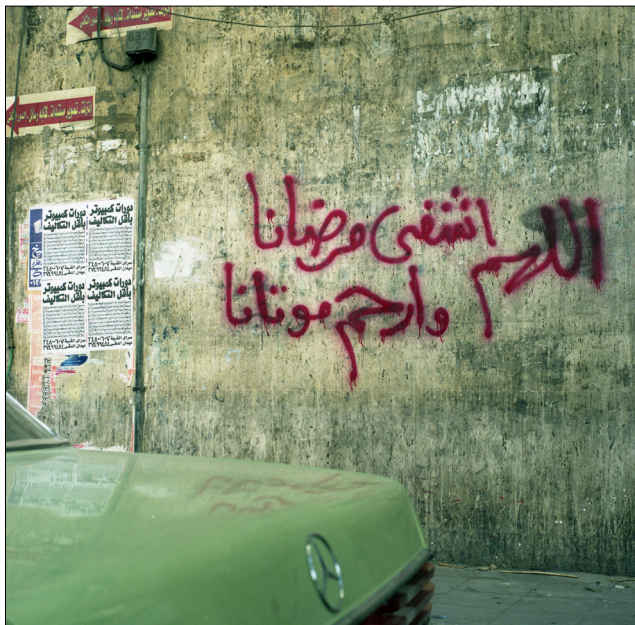
Figure 2: »Oh God, heal our sick and have mercy upon our dead.« Cairo, March 2010.