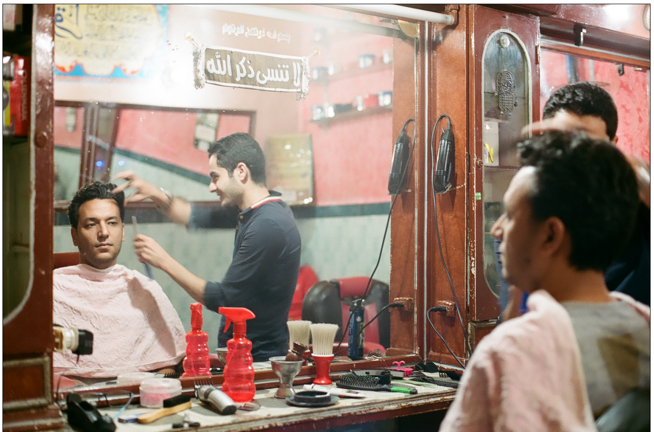
Figure 1: »Don't forget to say the name God.« Sticker in a barber shop in northern Egypt, 2016.

Luckily, many recent anthropological contributions have come up with textured understandings of how humans live with the God of the Qur'an. Contributions that have inspired this essay include dream visions and the elsewhere (Mittermaier 2011), livelihood (Nevola 2015a; Gaibazzi 2015), destiny (Elliot 2016; Menin 2015; Menin and Elliot 2018), death and resurrection (Hirschkind 2006), moral relations that involve God (Schaeublin 2016), the striving for paradise (Mittermaier 2019), theological talk about God (Moll 2018) and encounters with transcendence (Abenante and Vicini 2017). »Towards an Ethnography of God« was the title of a panel organised by Amira Mittermaier and Omri Elisha at the 2016 annual meeting of the American Anthropological Association. This emerging body of work also builds on and intertwines with longer-standing enquiries into invisible realms (Drieskens 2008; Suhr 2015; Doostdar 2018), and the veneration of the Prophet Muhammad (Mahmood 2009) and Muslim saints (Abu-Zahra 1997).