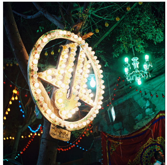
Figure 5: »Allah«. Transportable name of God made of electric lights at the annual festival (mulid) of al-Sayyida Fatima al-Nabawiya in Cairo, March 2008.

work in the past seven years has been in literary circles in Alexandria, two of them are poets, and the third is a master of improvised poetic expression in conversations. The role of poetic language and poetry is not only a fieldwork contingency. Language is a key means (but of course not the only one) of communication with and about God. Poetic language can make God's presence tangible among humans. At times it can also be involved in a heretical rethinking of that presence.